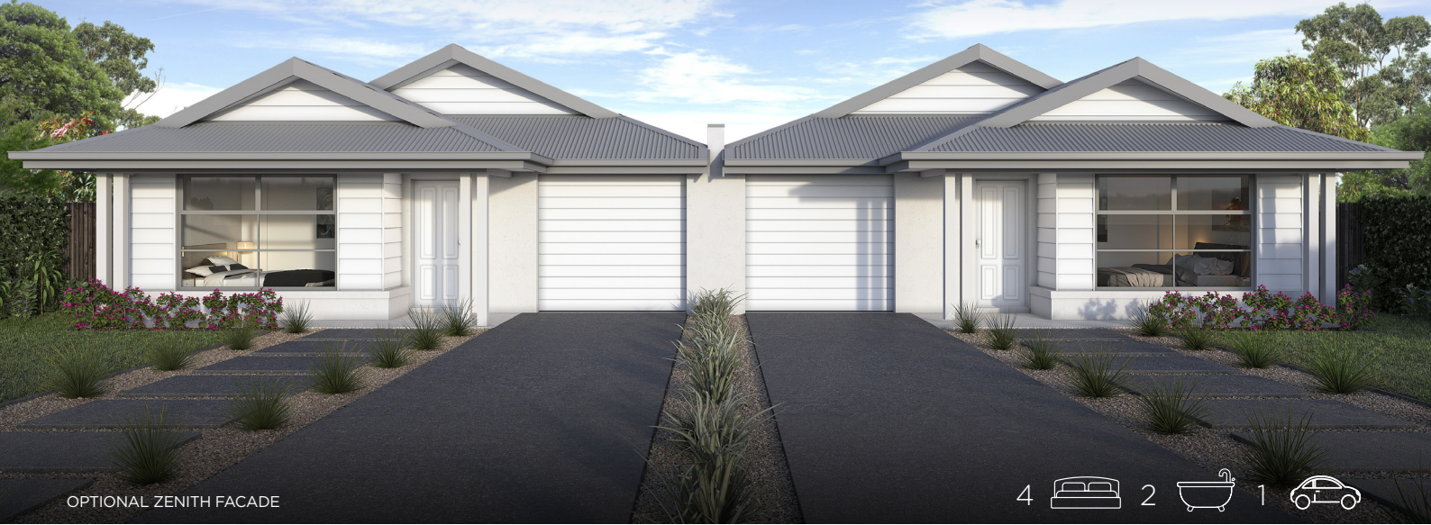
OPTIONAL ZENITH FACADE